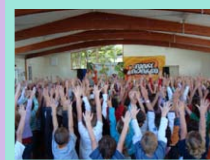
The Funky Monkeys play at Waimauku Primary School. Looks like fun. This could be you!